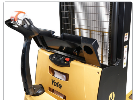
Quick-to-remove covers allow for easy access