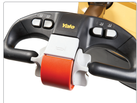
Butterfly switches allow for multiple operating positions for thumb and fingers, with either hand