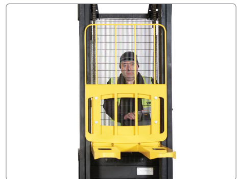
Excellent field of vision through mast